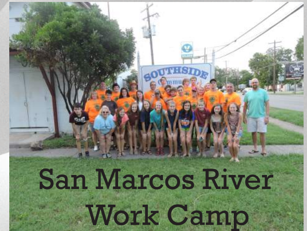
San Marcos River Work Camp

A project related to the Board of Missions of the United Methodist Church